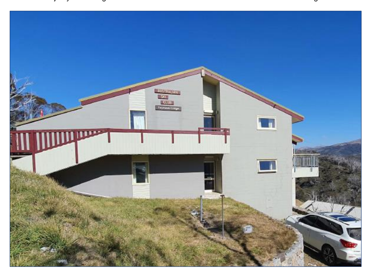
Figure 2 | Existing northern wall of the Australian Ski Club

Other similar tourist accommodation premises area located in the adjoining vicinity including Blue Cow Lodge to the north and Guthega Inn to the north-east. Vegetation at the site consists of native heath and trees. The majority of the vegetation is located on the southern / western side of the building.